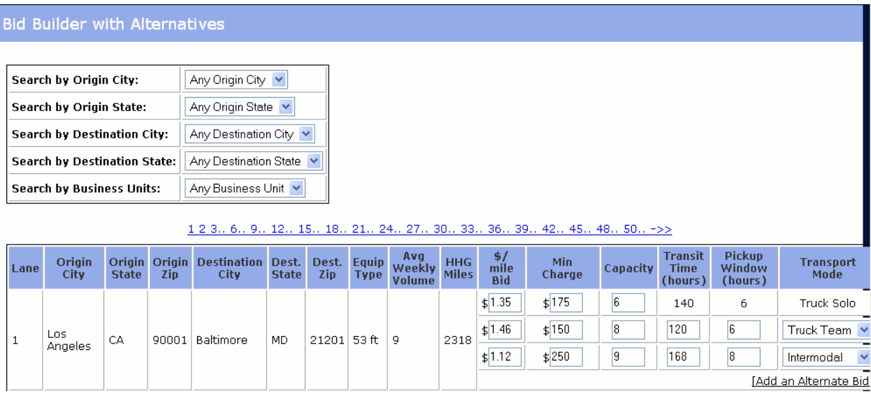
Figure 2. A simple example of bidding with alternates, cost drivers, attributes, and constraints. This piece of screen is from an actual event for sourcing truckload transportation. The figure shows part of the bid by one bidder on one item.