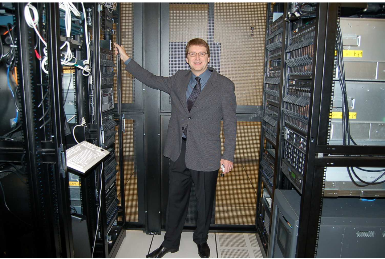
Figure 6. CombineNet's hosting architecture now includes hundreds of computers, hardware load balancers, redundant Internet, etc. Other aspects of the hosting include 24/7 monitoring of the hosting infrastructure, backup power from a generator, measures against overheating and fire, and physical security against unauthorized entry.